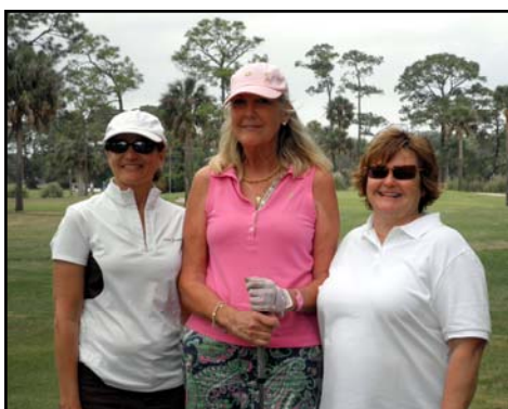
Golfers playing in our 2010 Builders Classic.