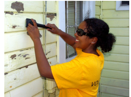
A volunteer works on an A Brush With Kindness home repair project.