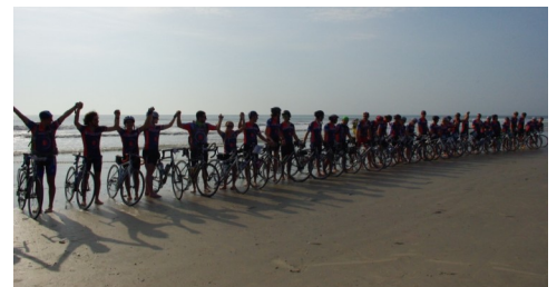
Bike and Build cyclists prepare to begin their cross-country journey.

housing sites. More than 30 cyclists volunteered at Huang Villas on May 20th. Before beginning their journey, the cyclists gathered in Neptune Beach to dip their rear wheels in the Atlantic Ocean. Once they have reached their destination, the cyclists will