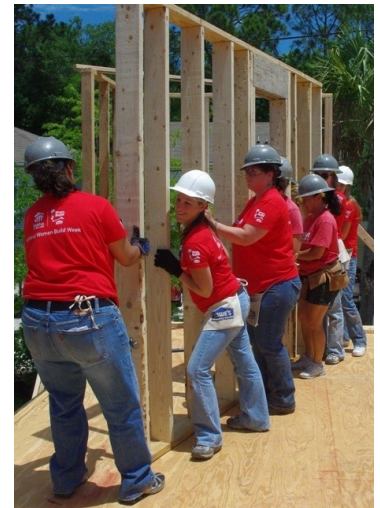
Lowe's employees and Women Builders frame a wall during National Women Build Week.